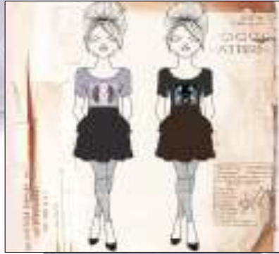
THE BELLE SKIRT £. 112