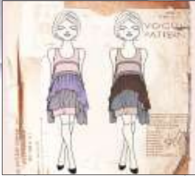
THE ANNIE RAGAMUFFIN DRESS £. 150