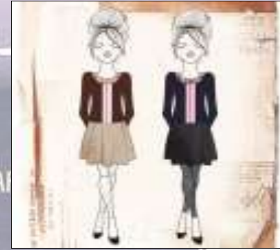
THE ANNIE RAGAMUFFIN DRESS £. 150