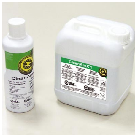
SOLUZIONI DI LAVAGGIO (CleanAreX® 1)