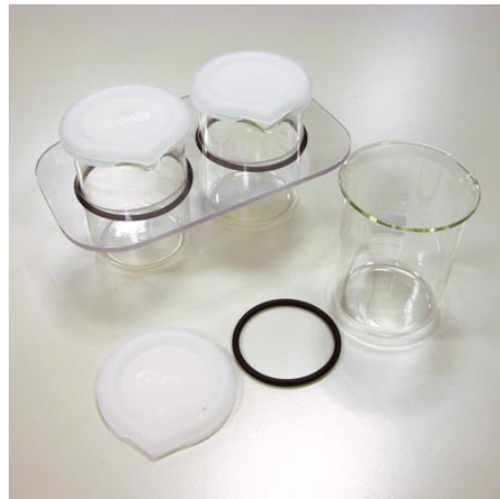
BEAKER E PORTA-BEAKER