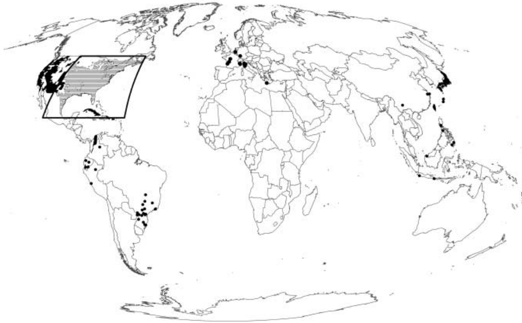
Figure 1 Distribution of native (barred) and non-native (black) populations of the American bullfrog. The inset represents the area of calibration of the suitability model. Distribution maps are from the Global Amphibian Assessment (Santos-Barrera et al. , 2004).

higher. The availability of climatic and land use data sets at global scale, and new modelling techniques have boosted the potential for such studies to evaluate the risk of invasion (Thuiller et al. , 2005).