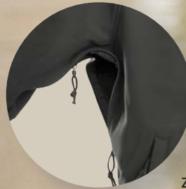
Zippers on sides.