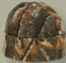
Fleece Hat Hardwoods®