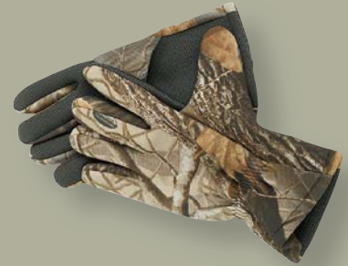
Neoprene Gloves Hardwoods®