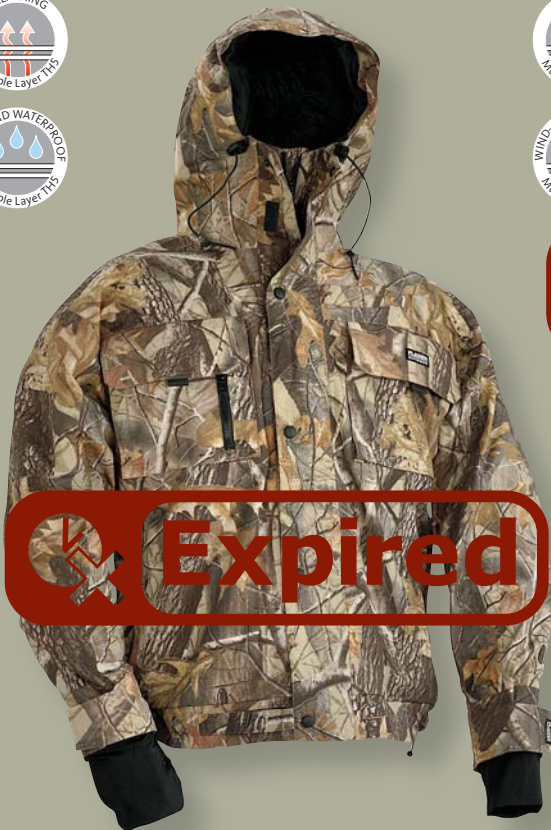
Allround Jacket Hardwoods®