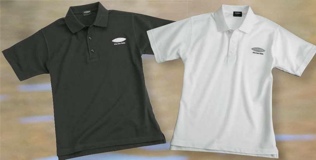
Polo Shirt - Black