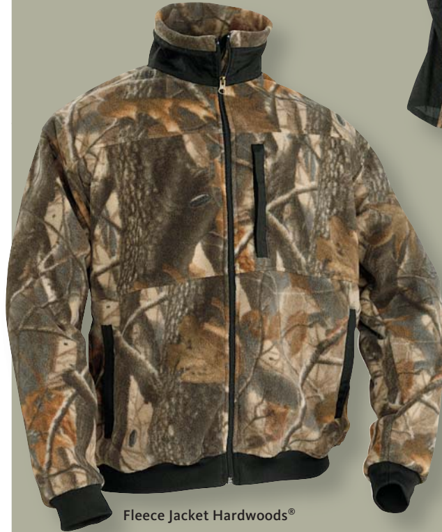
Fleece Jacket Hardwoods®