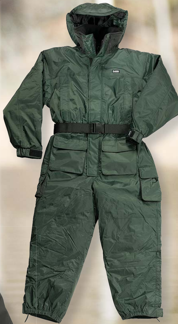
Thermal All Weather Suit