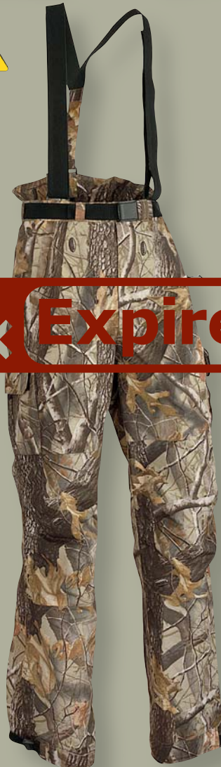
High Waist Trousers Hardwoods®