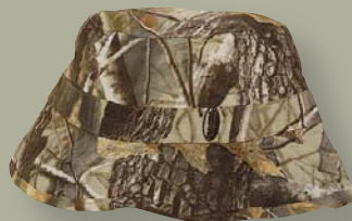
Bush Hat Hardwoods®