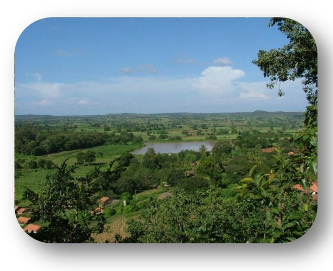
The Kalkeri Countryside

In this peaceful setting, the children enjoy the tranquillity necessary for their academic studies, music practice and many other cultural activities. The students are trained and taught by a team of experienced and motivated teachers, and many