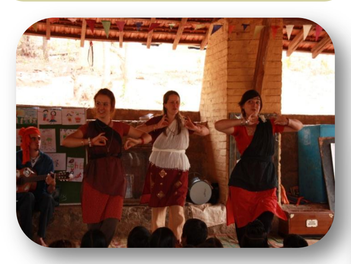
Volunteers Performing Indian Dance

Everyone at KSV attended the event. Volunteers and children gave a performance in which they sang the songs they had learnt during the year and a special composition they learned especially for the occasion.