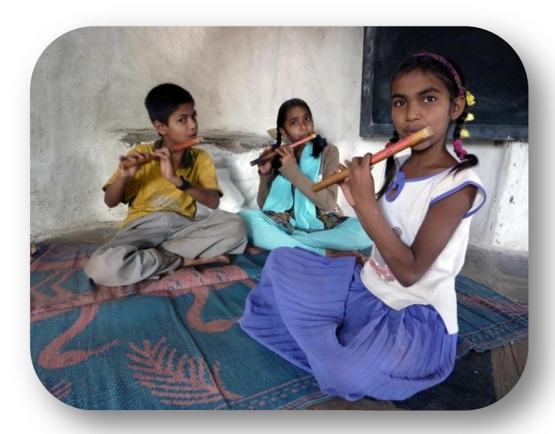
Children playing Bansuri Flutes donated by Akshar Kids

nce again the children have gone from strength to strength in their music studies. In fact the students are now at a stage where they are able to put on impressive music concerts in both vocal and instrumental. Each year the students are being entered for exams and the results are verv promising indeed. Out of all the students entered for the KSEEB Junior Music Exam in the last four years, they have all achieved a first class pass except one student who achieved a second