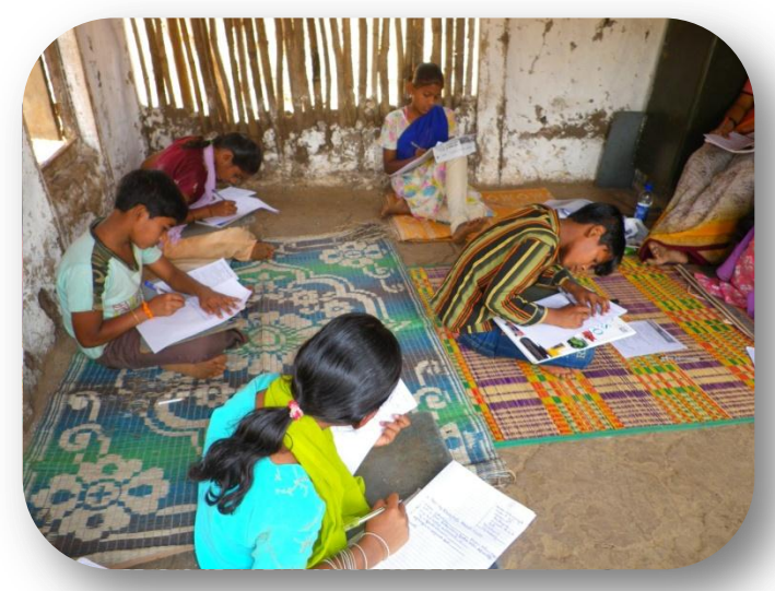
KSV Academic Exams

22nd March 2010 – Second Semester Academic Internal Exams