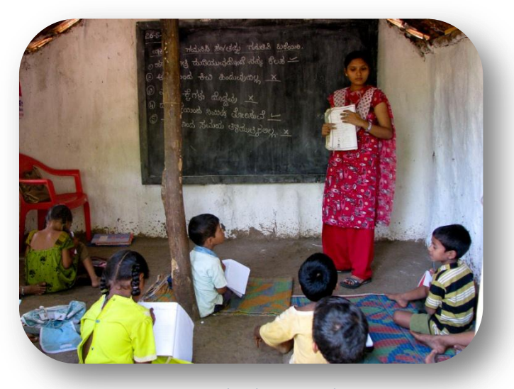
2<sup>nd</sup> Standard Extra Class

tudents admitted to the school come with a variety of academic abilities. Some have attended Government Schools; some have been to Private Schools; some have had no schooling whatsoever. All these different