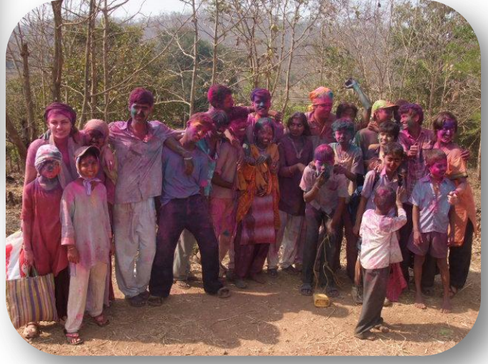
Celebrating Holi Festival