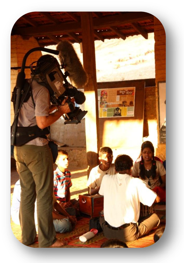
Artisans of Change Film Crew from Canada

games. KSV encourages its students to be creative rather than competitive but despite that the annual Olympic Games event is thoroughly enjoyed by everyone who takes part.