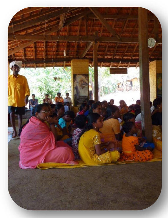
Parents and Children at Parent's Day

When the students returned from mid-term their holidays, KSV organized a parents' meeting day. Various talks were given about the importance of education, KSV's education policy and the importance of the students and their families respecting the school's code of conduct. The previous semester's exams results were also announced and prizes and certificates were awarded for the best students and for those showing considerable improvement.