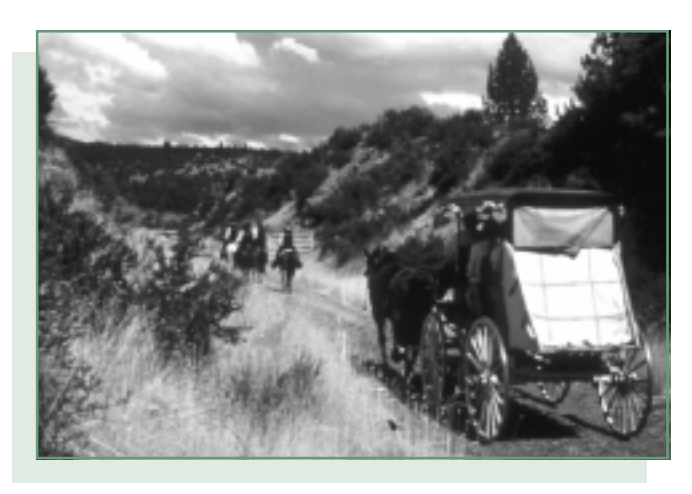
Equestrians enjoy the California countryside along the historic Bizz Johnson Trail.