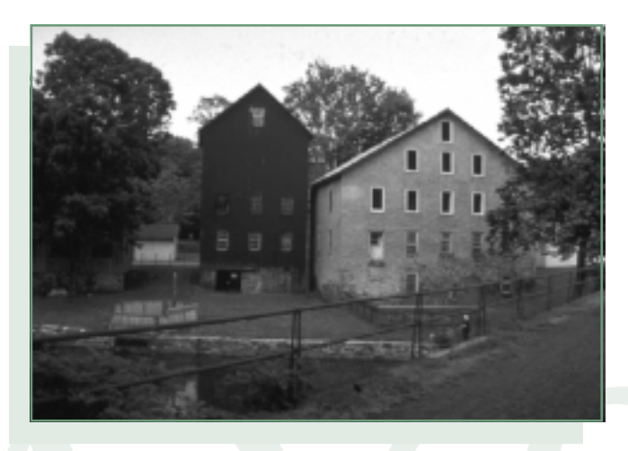
The Prallsville Mills near Stockton, New Jersey are among many structures preserved along the 68-mile Delaware and Raritan Canal State Park.

Trails and greenways provide a wealth of opportunities for people to learn about the history of places and people. By preserving transportation corridors and historic sites Americans give a valuable gift to future generations to learn about and cherish our culture.