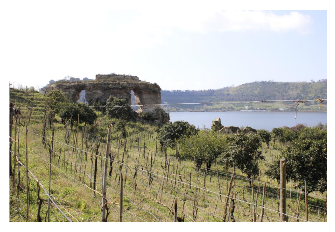
Il Lago d'Averno (Lake of Averno)

Pozzuoli, Temple of Serapide, Solfatara, Amphiteathre Flavio, Lakes of Lucrino and Averno, Port and Castle of Baia, Piscina Mirabilis , Tomb of Agrippina, Casina Vanvitelliana on the Fusaro's lake, Cape Miseno, Acropolis of Cuma and Grotto of Sibilla.