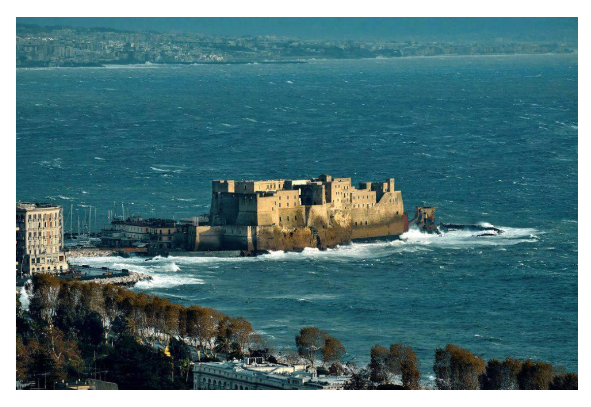
Il Castel dell'Ovo (The egg's Castle)

Walks and excursions on foot, car and boat, in order to discover some of the most beautiful places of Campania.